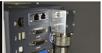
90° elbow connector