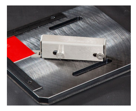
Sound-proof positioning plate with magnetic quick release clamp