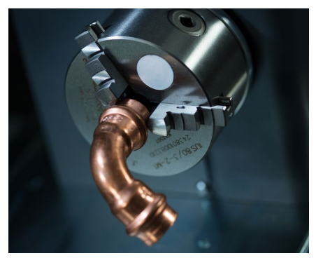
Rotary accessory for cylindrical parts marking