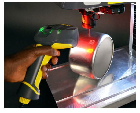
Hand-held or fixed-position scanner for code reading or checking