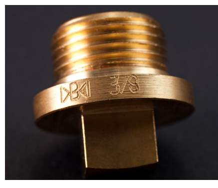
Various small parts