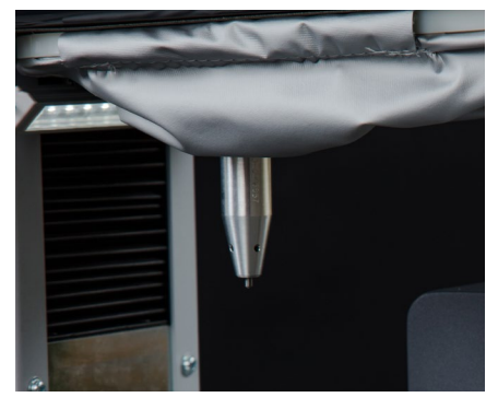
Protective bellow (optional)