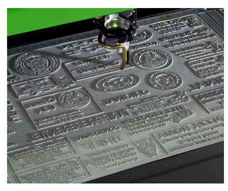
Engraving & laser cutting of custom ink stamps