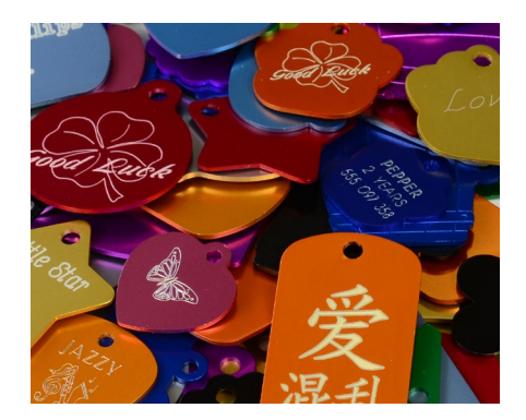
Pet and dog tags engraving