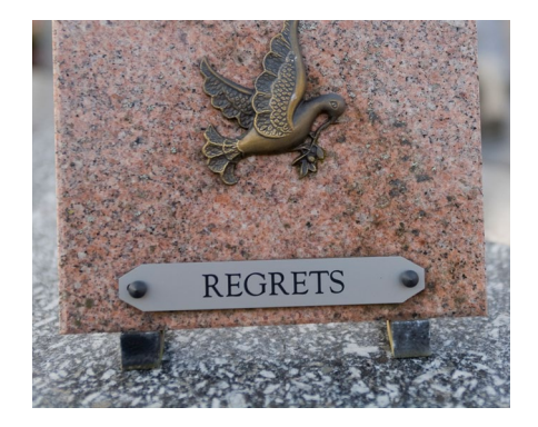
Funeral plaques and headstones engraving