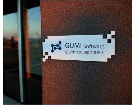
POP displays and sign engraving